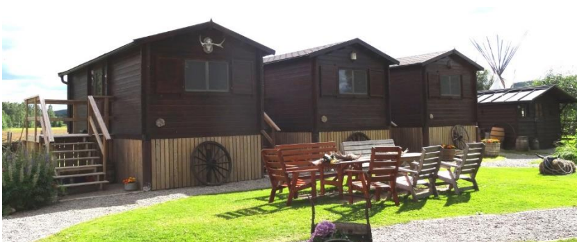
3 cabins with 2 rooms & shower and 1 camping cabin (no shower)

Breakfast: 120 Sek p/adult, 90 Sek kids till 13y