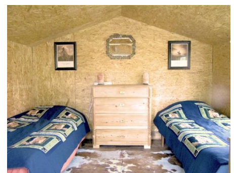
Inside of the camping cabin